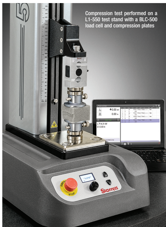
Compression test performed on a L1-550 test stand with a BLC-500 load cell and compression plates

The MTH has a load measurement capacity of 2500N (550lbf, 250kgf) and can be used for compression or tensile testing. The mechanical advantage afforded by the MTH-550's precision, high-resolution worm gear design lets you test effortlessly. One rotation of the handwheel positions the crosshead 0.75mm (0.03 inch). Total stroke for the MTH-550 is 102mm (4-inches). Force measurement is performed using a Starrett digital force gauge.