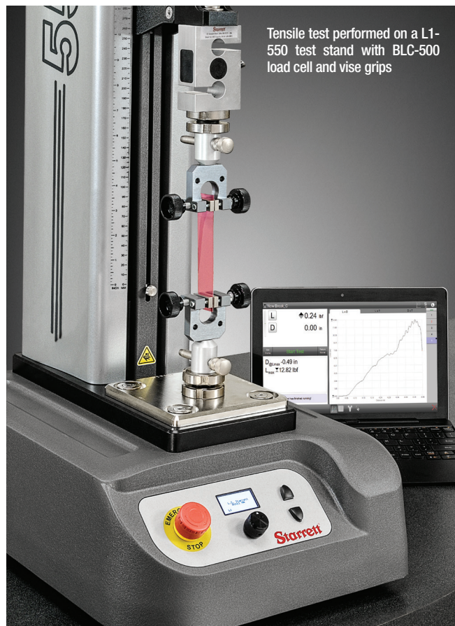
Tensile test performed on a L1-550 test stand with BLC-500 load cell and vise grips